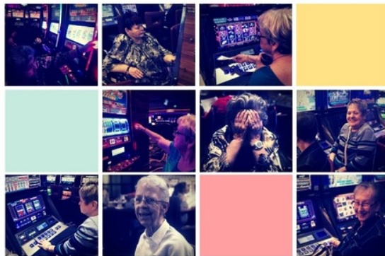
McFarlan Villages CASINO TRIP