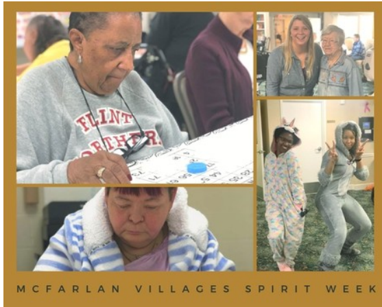
MCFARLAN VILLAGES SPIRIT WEEK